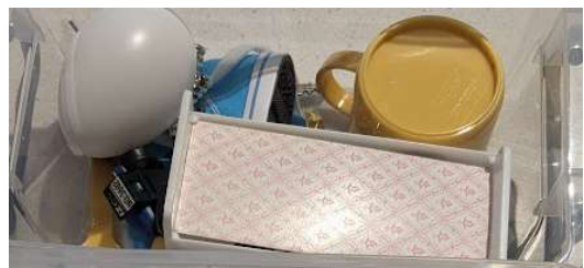
EAL toy box