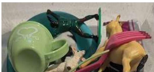
McCormick Toy Test toy box

These boxes contain 14 toys that represent the words in the McCormick Toy Test or English as an Additional Language Toy Test. Toy Tests are a quick and reliable means of assessing hearing in children and can be used with either live or recorded voice. They are especially useful for very young children who cannot be tested using other audiometric means. The toy box is plastic so it can be cleaned using wipes for infection control. Laminated score sheet included.